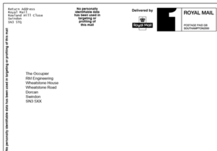
Fig 3: For postcards only, the Declaration location can be placed in either of the positions shown

the Mailing Items. Figure 3 below illustrates the two alternatives for the position of the Declaration for postcards: